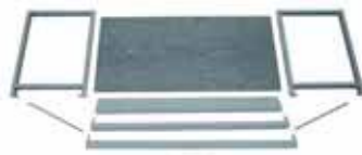
Simple flat pack assembly for a basic bench 600mm wide including all assembly fixings