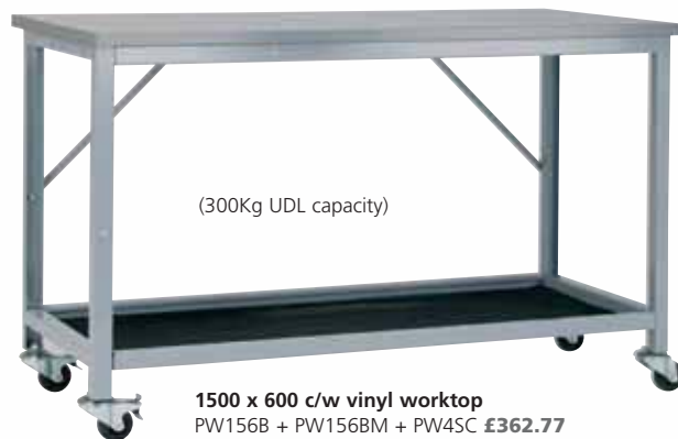
(300Kg UDL capacity)