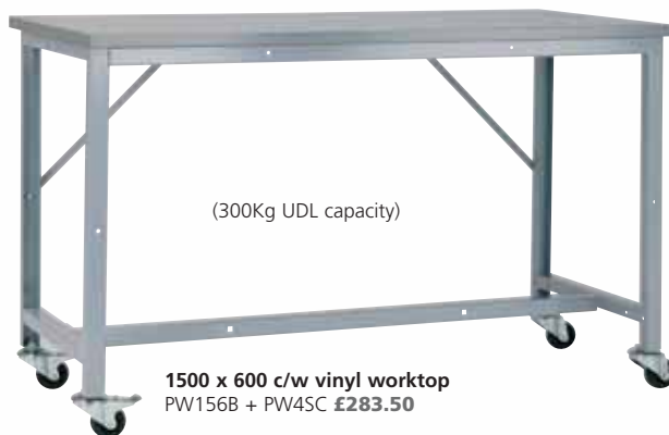
(300Kg UDL capacity)