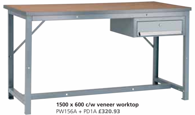
1500 x 600 c/w veneer worktop PW156A + PD1A £320.93