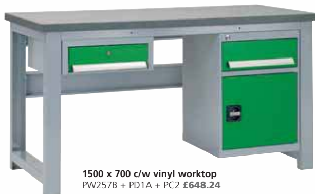
1500 x 700 c/w vinyl worktop PW257B + PD1A + PC2 £648.24

C = 25mm thick plain cut MDF *Add C to end of order code