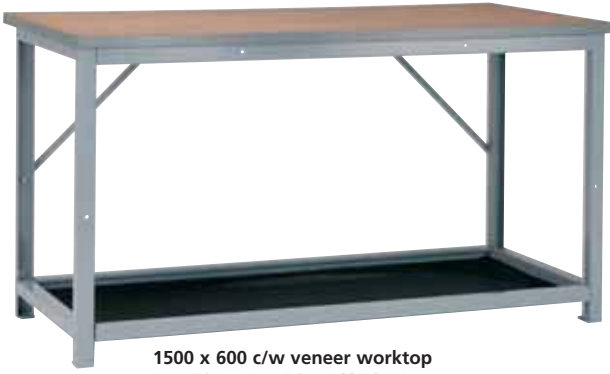
1500 x 600 c/w veneer worktop PW156A + PW156BM £258.51