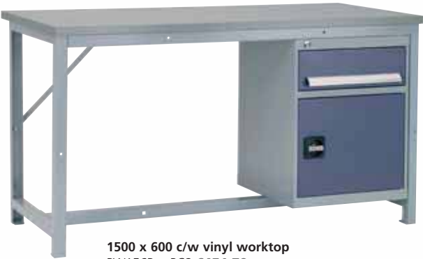
1500 x 600 c/w vinyl worktop PW156B + PC2 £451.79