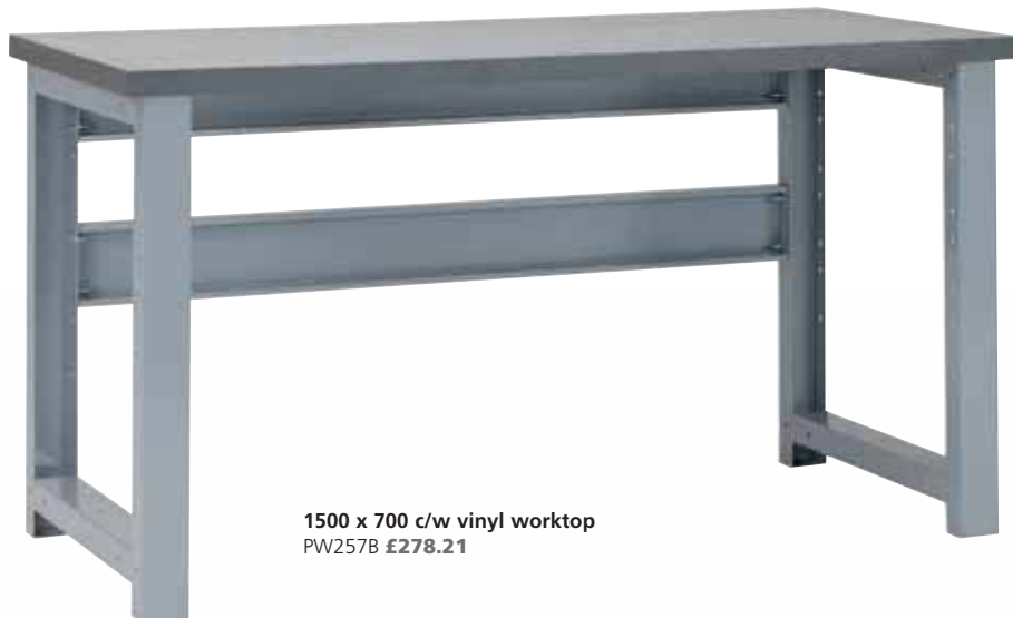
1500 x 700 c/w vinyl worktop PW257B £278.21