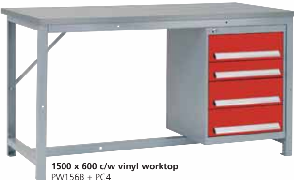
1500 x 600 c/w vinyl worktop PW156B + PC4 USUAL PRICE £596.73 SPECIAL OFFER £562.44