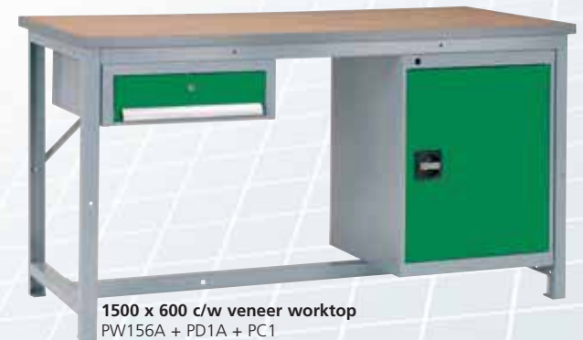
1500 x 600 c/w veneer worktop PW156A + PD1A + PC1 USUAL PRICE £507.09 SPECIAL OFFER £481.74