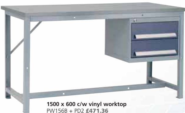
1500 x 600 c/w vinyl worktop PW156B + PD2 £471.36