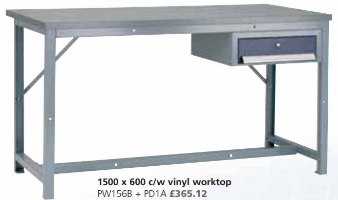
1500 x 600 c/w vinyl worktop PW156B + PD1A £365.12