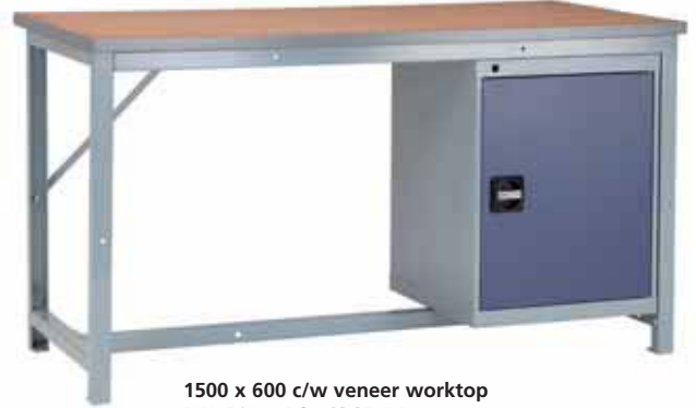
1500 x 600 c/w veneer worktop PW156A + PC1 £365.41