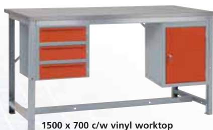
1500 x 700 c/w vinyl worktop PW157B + D3 + C1 £570.52