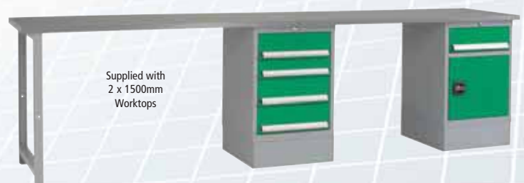
Model 11: PLU600+PPC4+PPC2+W56B+W56B £886.09