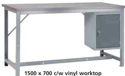
1500 x 700 c/w vinyl worktop PW157B + C1 £369.28