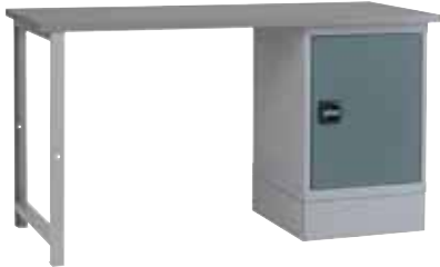
Model 1: PLU600+PPC1+W56B £355.10

Flat pack modular workbench system offering a variety of storage and workspace solutions. Leg frames are constructed from fabricated steel section to bolt to the worktop. 650mm high premier units are mounted on 150mm high steel plinths. All cabinets are lockable and contain 1 adjustable shelf. All drawers are mounted on precision ball bearing telescopic slides offering a 40Kg (UDL) capacity.