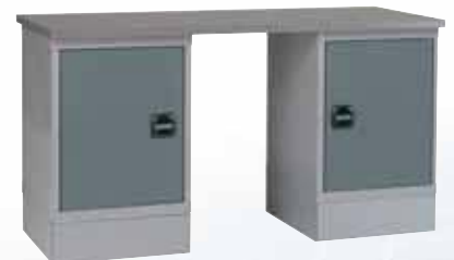
Model 9: PPC1+PPC1+W56B £517.84