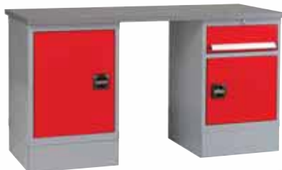
Model 8: PPC1+PPC2+W56B £560.02