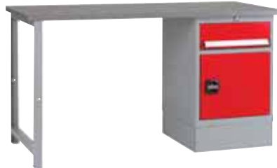
Model 2: PLU600+PPC2+W56B £397.28