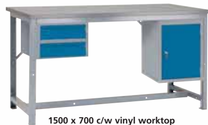
1500 x 700 c/w vinyl worktop PW157B + D2 + C1 £513.62