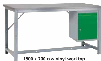
1500 x 700 c/w vinyl worktop PW157B + CD1 £473.37