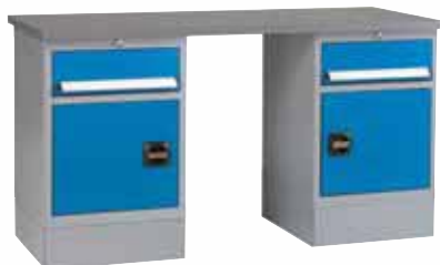
Model 7: PPC2+PPC2+W56B £602.20