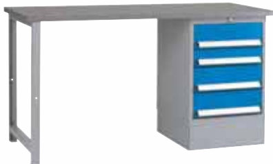
Model 3: PLU600+PPC4+W56B £542.23