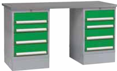
Model 5: PPC4+PPC4+W56B £892.09