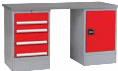
Model 4: PPC4+PPC1+W56B £704.97