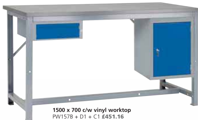
1500 x 700 c/w vinyl worktop PW157B + D1 + C1 £451.16