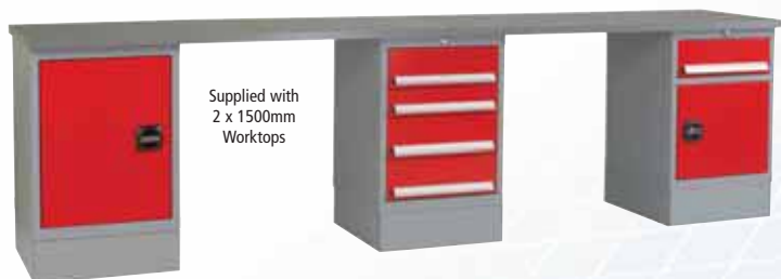
Model 10: PPC1+PPC4+PPC2+W56B+W56B £1,048.82

Create a run... Choose your size, storage option, worktop and go. All benches are 830mm high. Mid grey (RAL 7001) carcass with colour choice drawers/doors.