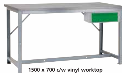
1500 x 700 c/w vinyl worktop PW157B + D1 £342.91