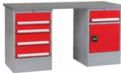
Model 6: PPC4+PPC2+W56B £747.14