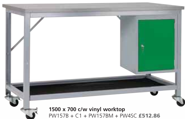
1500 x 700 c/w vinyl worktop PW157B + C1 + PW157BM + PW4SC £512.86

Take your workbench to the job with a mobile version of the prem-econ workbench system.