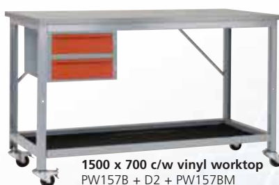
1500 x 700 c/w vinyl worktop PW157B + D2 + PW157BM + PW4SC £548.95