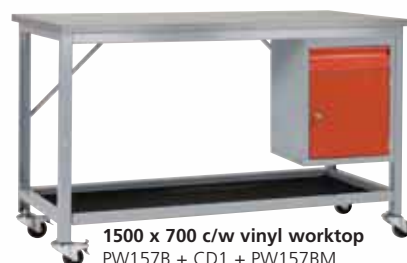
1500 x 700 c/w vinyl worktop PW157B + CD1 + PW157BM + PW4SC £616.95