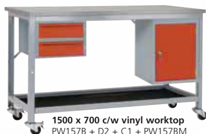
1500 x 700 c/w vinyl worktop PW157B + D2 + C1 + PW157BM + PW4SC £657.20