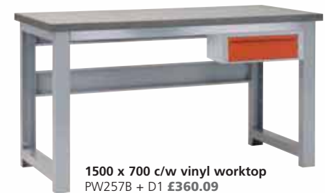
1500 x 700 c/w vinyl worktop PW257B + D1 £360.09