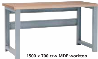
1500 x 700 c/w MDF worktop PW257C £204.92

C = 25mm thick plain cut MDF *Add C to end of order code