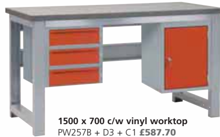
1500 x 700 c/w vinyl worktop PW257B + D3 + C1 £587.70