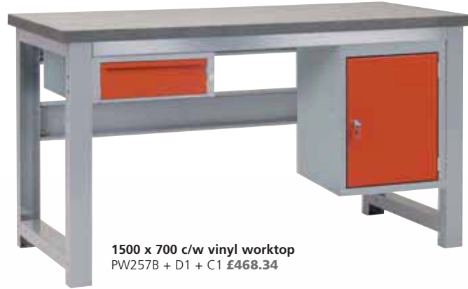
1500 x 700 c/w vinyl worktop PW257B + D1 + C1 £468.34