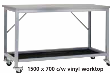
1500 x 700 c/w vinyl worktop PW157B + PW157BM + PW4SC £404.61