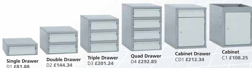
Single Drawer D1 £81.88