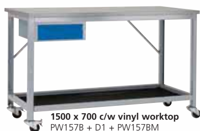
1500 x 700 c/w vinyl worktop PW157B + D1 + PW157BM + PW4SC £486.49