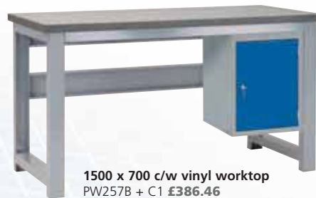
1500 x 700 c/w vinyl worktop PW257B + C1 £386.46