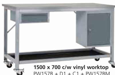
1500 x 700 c/w vinyl worktop PW157B + D1 + C1 + PW157BM + PW4SC £594.74