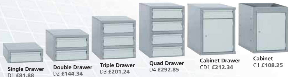
Single Drawer D1 £81.88