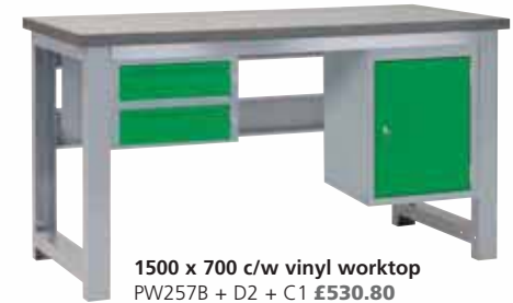
1500 x 700 c/w vinyl worktop PW257B + D2 + C1 £530.80