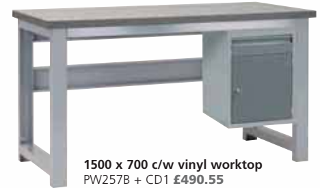
1500 x 700 c/w vinyl worktop PW257B + CD1 £490.55