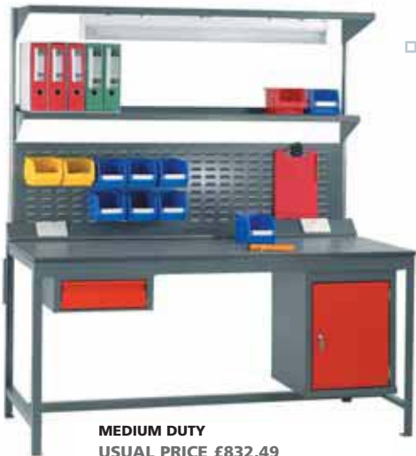
MEDIUM DUTY USUAL PRICE £832.49 SPECIAL OFFER £795.95

A comprehensive range of fully welded angle iron construction workbenches with a variety of worktop options and accessories. All workbenches are 840mm high as standard, other heights available. Popular models - available in all sizes from 1200mm long x 600mm wide to 1800mm long x 900mm wide. All workbenches are 840mm high as standard, other heights available.