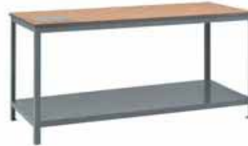
1800 x 750 c/w MDF worktop MD: 40187D + BS18 £350.98 HD: 44187A + BS18 £370.23