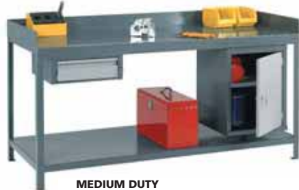
MEDIUM DUTY USUAL PRICE £540.46 SPECIAL OFFER £449.95