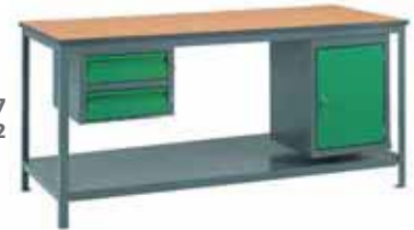
1800 x 750 c/w MDF worktop MD: 40187D + BS18 + D2 + C1 £603.57 HD: 44187A + BS18 + D2 + C1 £622.82