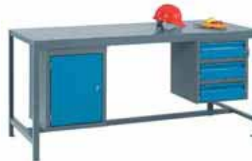
1800 x 750 c/w Steel worktop MD: 38187 + C1 + C3 £557.14 HD: 42187 + C1 + C3 £598.72