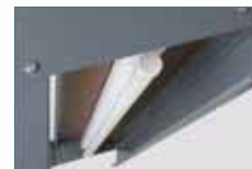
1500mm Overhead Light