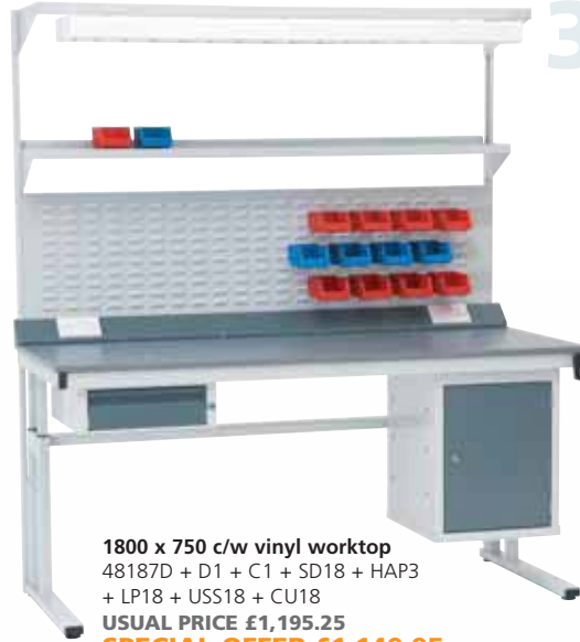
1800 x 750 c/w vinyl worktop 48187D + D1 + C1 + SD18 + HAP3 + LP18 + USS18 + CU18 USUAL PRICE £1,195.25 SPECIAL OFFER £1,149.95