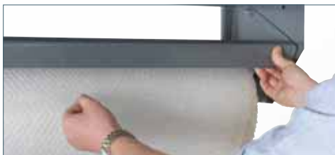
Roll Holder with Lift Out Support Bar

Constructed with a 25mm thick medium-density chipboard Worktop bonded to which to be a 1.5mm thick grey vinyl covering, and with grey PVC edging all round. Supplied with the workbench, an upper shelf edged all round in grey PVC, positioned 900mm above the work surface. Fitted to the underside of the shelf is a full-length paper roll holder complete with lift-out support bar and roll locating brackets.