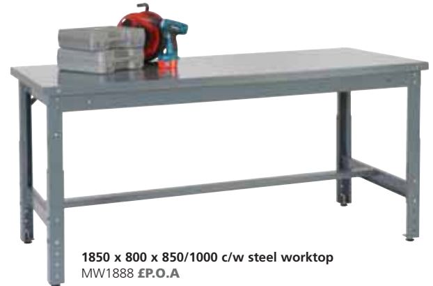
1850 x 800 x 850/1000 c/w steel worktop MW1888 £P.O.A

Complete assembly supplied in flat-pack bolted form, finished epoxy powder-coated Grey (RAL7031).