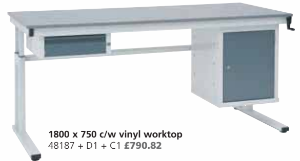
1800 x 750 c/w vinyl worktop 48187 + D1 + C1 £790.82