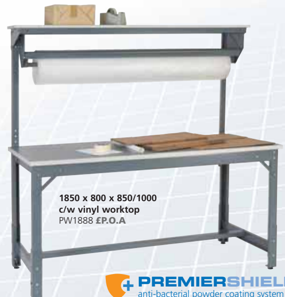
1850 x 800 x 850/1000 c/w vinyl worktop PW1888 £P.O.A

Complete assembly supplied in flat-pack bolted form, with all necessary fixing bolts, illustrated assembly instructions, and detailed parts list, finished epoxy powder-coated Grey (RAL7031).