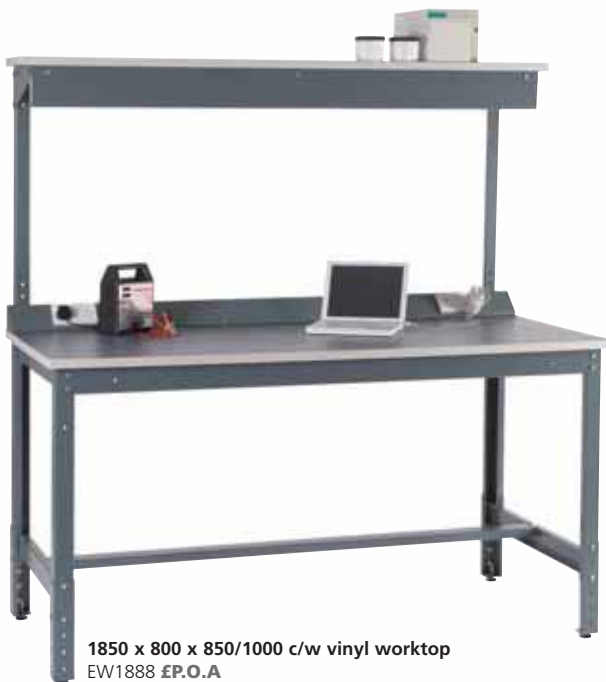
1850 x 800 x 850/1000 c/w vinyl worktop EW1888 £P.O.A

Complete assembly supplied in flat-pack bolted form, with all necessary fixing bolts, illustrated assembly instructions, and detailed parts list, finished epoxy powder-coated Grey (RAL7031).