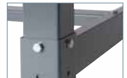
Adjustable Leg Supports