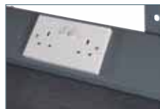
Services Duct (unwired)