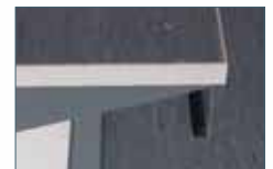
300mm Deep Vinyl Shelf