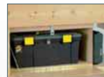
Security Cupboard Left or Right Positioning. Lockable