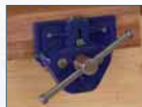
Record Vice 175mm Jaws (Factory fitted only)