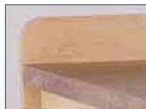
Back Lip 18mm Plywood