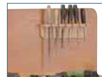
Back Panel 305mm High