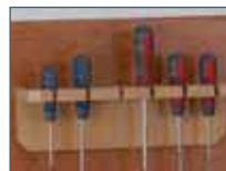
Tool Rack 6 Slot - Back Panel or Side Mounted