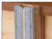
Plane Stop Prevents work in progress moving