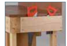
Saw Rack Left or Right Mounted