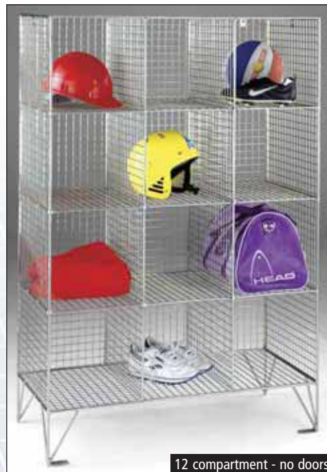
12 compartment - no doors

Offering a solution to multiple storage of smaller personal items. 12 or 16 compartment available with or without doors. 40 compartment available with or without double doors.