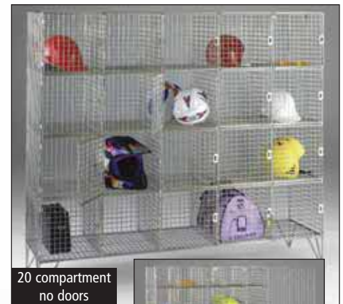
20 compartment no doors