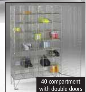
40 compartment with double doors