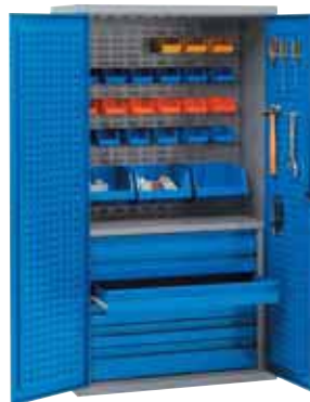
BEURO CABINET P49