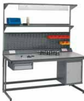
CANTILEVER WORKBENCH P33