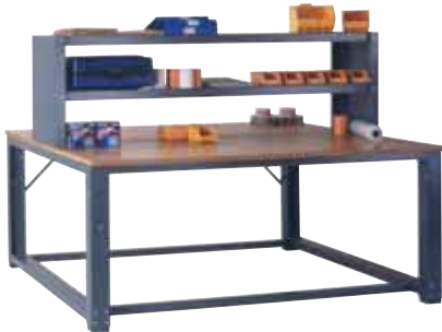
INFINITE WORKBENCH P30