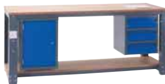
INFINITE WORKBENCH P31