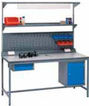
SQUARE TUBE WORKBENCH P32