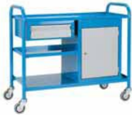
PREMIER TROLLEY P45