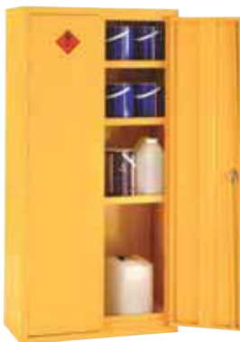
HAZARDOUS CABINET P9 3 - 5 Working Day Delivery Ref: 88F894