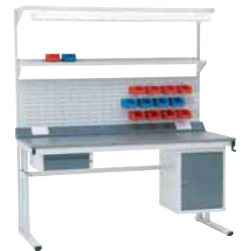
HEIGHT ADJUST WORKBENCH P38