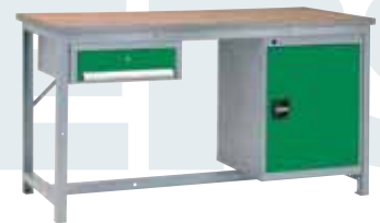
PREMIER WORKBENCH P21