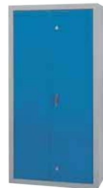
SECURITY CABINET P55