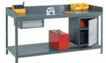
MEDIUM DUTY WORKBENCH P35