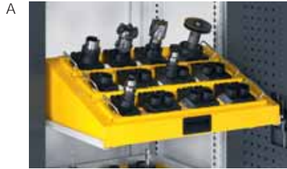
CNC tool storage shelf, for carriers - extendable. holds upto 80kg will require 3 tool carriers, page 124