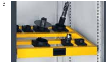
CNC tool storage shelf - extendable. holds upto 80kg, tool inserts fit directly onto shelf will require tool inserts - page 127 The useable space for tool inserts is 3 x 625mm for example, when using 50mm tool inserts, the maximum amount that would fit in 3 rows is 36.