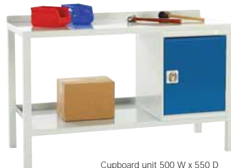
Cupboard unit 500 W x 550 D x 600mm high with adjustable shelf and 520mm door