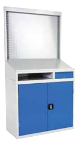
workstation with backpanel