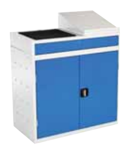
Combi Top Computer Station