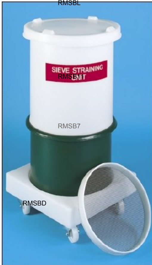
Illustration shows: Sieve straining unit comprising:- 1 x RMSBD (Natural), 1 x Sieve, 1 x RMSB7 (Green), 1 x RMSB11 (Natural), 1 x RMSBL (Natural)