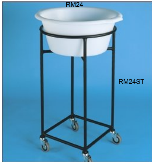
Illustration shows: RM24 Natural Bowl moulded in food grade polyethylene. RM24ST Powder coated mobile stand. Range -30°C to +80°C. Lid available (Code RM35L). Stainless steel stand optional.