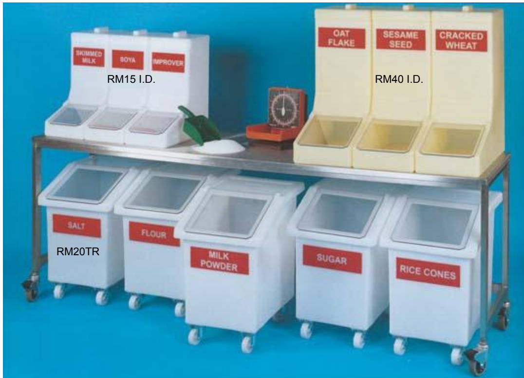
Illustration above shows:- 1xStainless Steel Table. 5xRM20TR (Natural). 3xRM15 I.D. Ingredient Dispensers (Natural). 3xRM40 I.D. Ingredient Dispensers (Yellow).