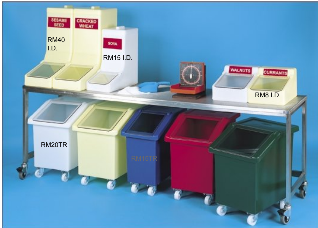
Illustration above shows:-