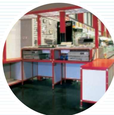
ANGLE AND SQUARE TUBE CONSTRUCTION SYSTEMS