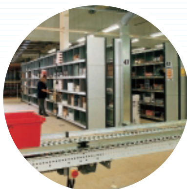
HEAVY DUTY SHELVING