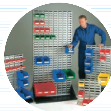
SMALL PARTS STORAGE