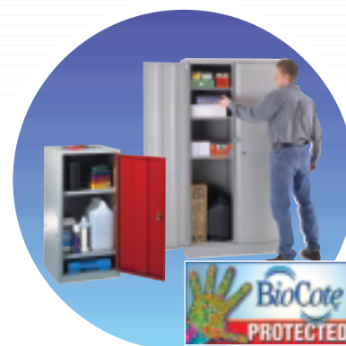
COMMERCIAL AND WORKPLACE EQUIPMENT