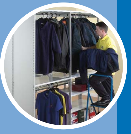
The easy interchangability of accessories enables the user to tailor storage needs to meet his requirements