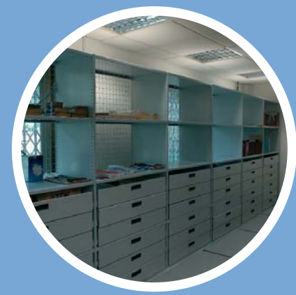
Stormor shelving helps create a more tidier and efficient stock storage solution