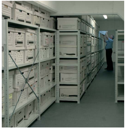
For large high-rise or multi-tier filing and archive installations Stormor's slim profile shelves can be used with our proven Euro-Shelving system to maximise available space.