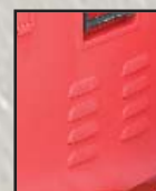
Loured Fume Venting