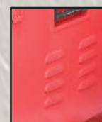
Loured Fume Venting