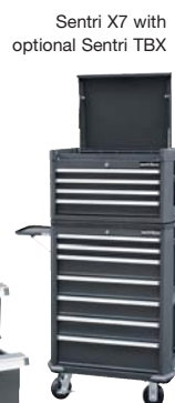
Sentri X7 with optional Sentri TBX