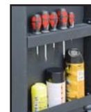
Side storage for Sentri X5, Sentri X7, Sentri X WST/11 and Sentri X WST/7