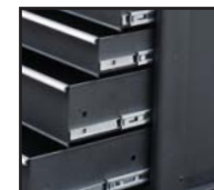
Ballbearing slides on all drawers

OVERALL DIMS 1035mm L x 460mm D x 900mm H (ex. 125mm wheels) WEIGHT 99 KG