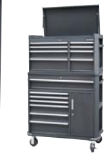
Sentri X WST7 with optional Sentri X WST/TB