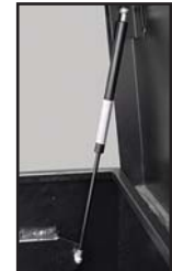
Hydraulic lift and lower