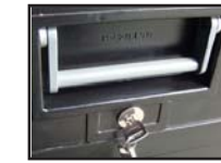
single key opening

(1196mm L x 1275mm H x 643mm W overall size) (1132mm L x 1200mm H x 600mm W internal size) 162kg