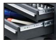
Ballbearing slides on all drawers

OVERALL DIMS 780mm L x 410mm D x 900mm H (ex. 100mm wheels) WEIGHT 33KG