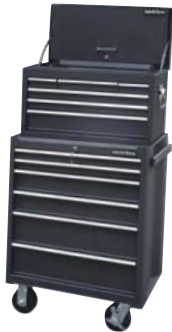
Sentri 6 with optional Sentri TB

OVERALL DIMS 690mm L x 460mm D x 735mm H (ex. 125mm wheels) WEIGHT 73 KG