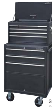
Sentri 4 with optional Sentri TB

OVERALL DIMS 690mm L x 460mm D x 735mm H (ex. 125mm wheels) WEIGHT 55 KG