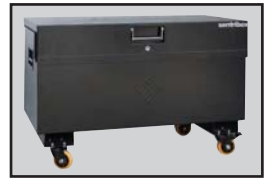
Optional easy fit heavy duty wheel kit (see below)