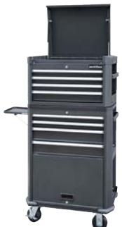
Sentri X5 with optional Sentri TBX