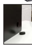
Power cable access with cover