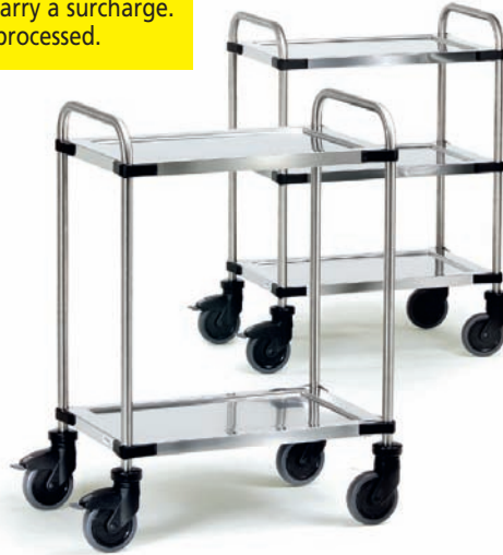
142 Stainless Steel Trolleys