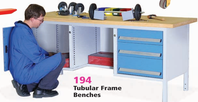
194 Tubular Frame Benches