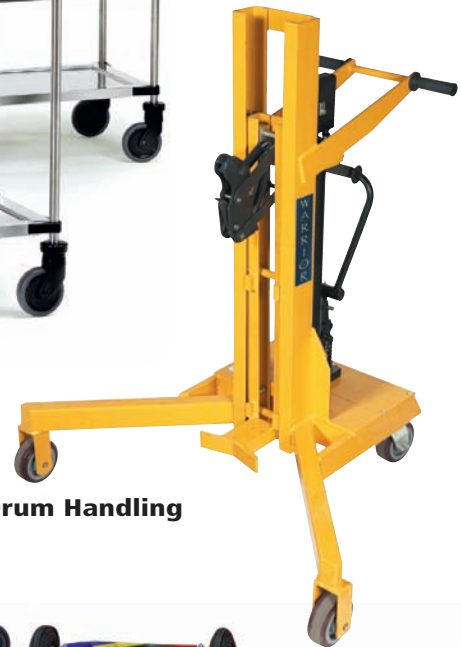
132 Drum Handling