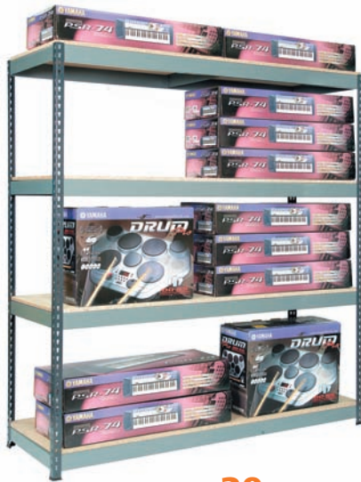
30 Boltless Shelving

PRICE FLUCTUATIONS Due to the volatile nature of the currency markets, especially the pound against the euro, some products may carry a surcharge. If this is the case you will be informed before your order is processed.