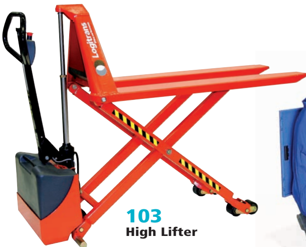
103 High Lifter