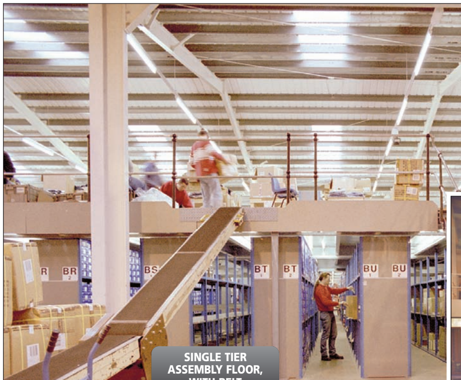
SINGLE TIER ASSEMBLY FLOOR, WITH BELT CONVEYOR FEED