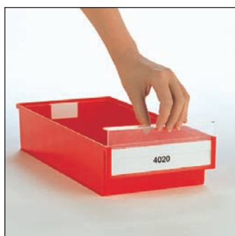
Labels with protective shields are included