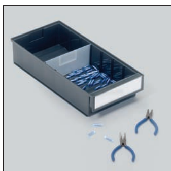
Cross dividers are available