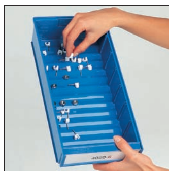
Corrugated bases for quicker small item picking