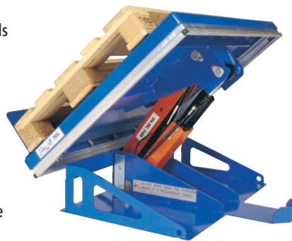
750kg Capacity Armlift