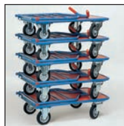
Safe horizontal stacking