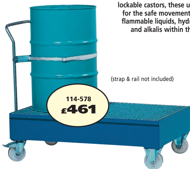
(strap & rail not included)