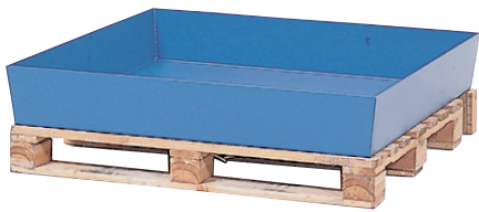
107-042 107-044 (timber pallet is not included)

✓ Meet the demands of European Environmental Regulations with these static and mobile sumps and pallets. Manufactured from 3mm steel, they are suitable for the storage of flammable liquids and hydrocarbons