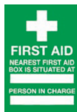
First Aid Nearest First Aid Box S3006