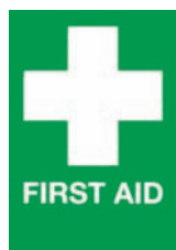
First Aid S3002