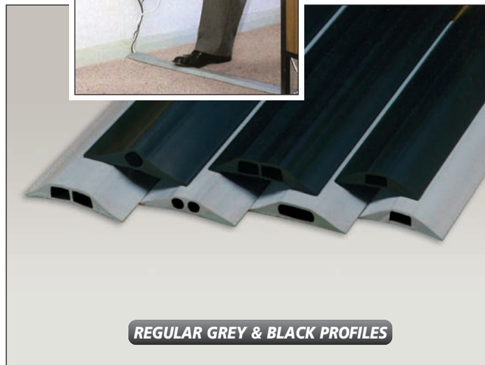
REGULAR GREY & BLACK PROFILES