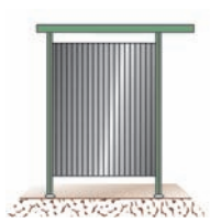
Closed Back Shelters Free standing shelter with back and end sheets.