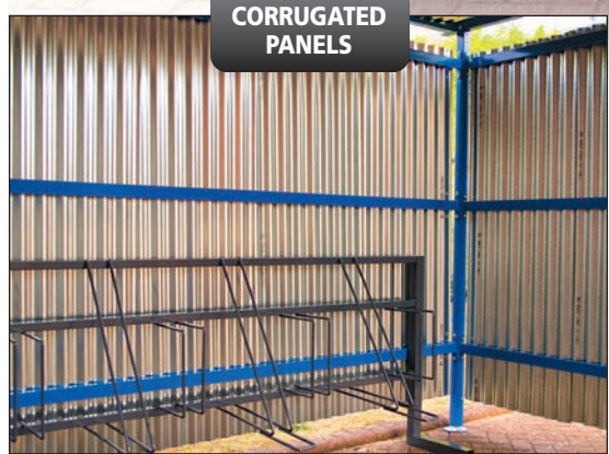
GALVANISED CORRUGATED PANELS