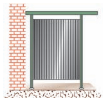
Wall Fixing Shelter with open back for wall fixing.