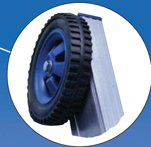
WALL RUNNING WHEELS