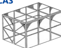
2480H x 2520W x 3700Dmm double doors