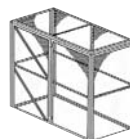
2480H x 2520W x 1260Dmm single door