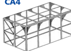
2480H x 2520W x 4920Dmm double doors