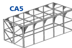
2480H x 2520W x 6140Dmm double doors