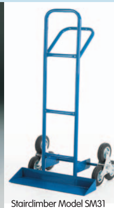
Stairclimber Model SM31

New Product, designed to meet customer's need