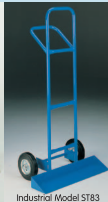
Industrial Model ST83