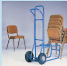
Alternative support designs available