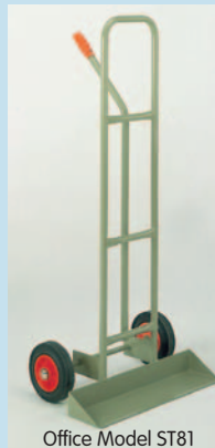
Office Model ST81