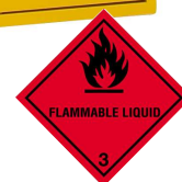
Flammable Cabinets Yellow BS08E51