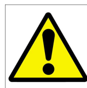
Pesticide / Chemical Cabinet Red BS04E53