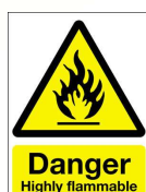
Flammable Cabinet D. Grey BS632