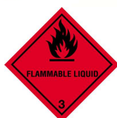
Flammable Cabinet Yellow BS08E51