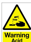
Acid Cabinet White BS00E55